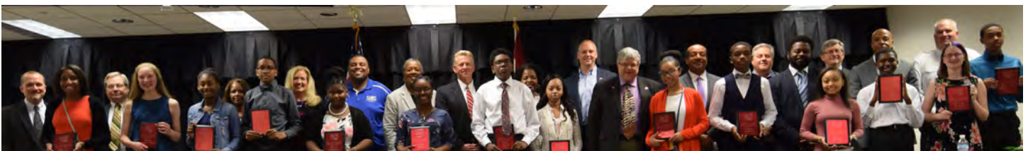
The entire group of participants of the 2018 Student Government Night and their respective village officials.