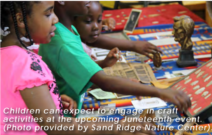
Children can expect to engage in craft activities at the upcoming Juneteenth event. (Photo provided by Sand Ridge Nature Center).

On Saturday, June 16, from 10 a.m. to 3 p.m., Sand Ridge Nature Center will celebrate freedom, family and country with Underground Railroad interactive interpretive hikes, traditional music, a wild edibles display, period recipe samples, crafts, and more.