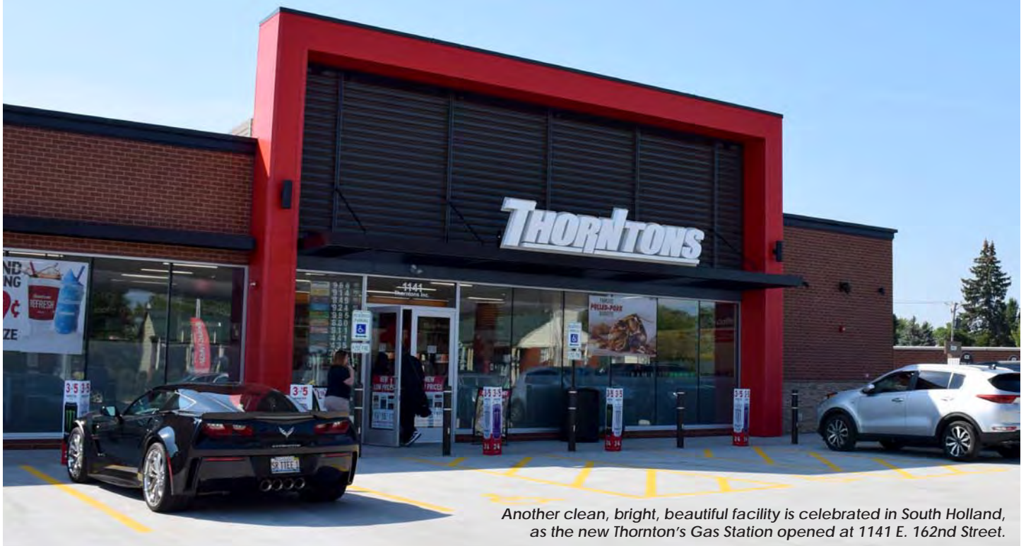
Another clean, bright, beautiful facility is celebrated in South Holland, as the new Thornton's Gas Station opened at 1141 E. 162nd Street.