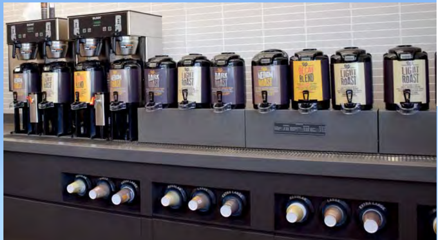
Among its many service and product offerings at the new Thornton's Gas Station is an expansive line of coffee flavors.

In addition to providing gas, Thornton's also serves hot, made to order food items for breakfast and lunch. The menu includes warm biscuits with sausage and egg, grilled polishes, hot dogs, wraps and burritos. They also have vegetarian items such as fresh salads and fruits. The store has a variety of items to satisfy just about every traveler's tastes. To see everything Thornton's has to offer, stop by and grab a bite to eat before or after you fill up your gas tank. You'll be so glad you did!