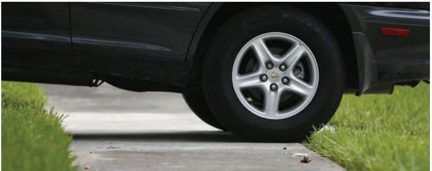
South Holland Police reminds residents that parking on or over sidewalks is prohibited.