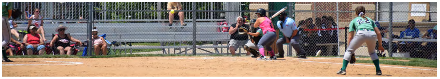
Public Works will again prepare the softball fields at Veterans Memorial Park to accommodate games played by sports organizations, such as the Little League. 2017 will be the third year that the Little League Regional Girls Softball tournament will be played in South Holland.