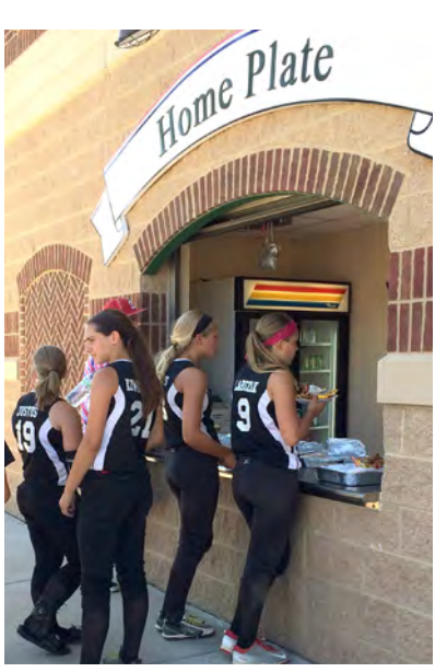
Home Plate Grill draws a steady stream of customers during the baseball/softball season.

Gouwens Park also offers concession most evenings during the baseball season. Hours of operation are 5 to 9 p.m., and Saturdays as needed for a game.