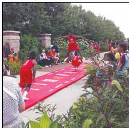
The always-popular Jesse White Tumblers performed for the crowd.