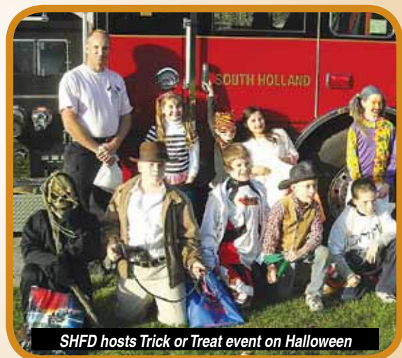
SHFD hosts Trick or Treat event on Halloween

SOUTH HOLLAND RESIDENTS CAN TRICK-OR-TREAT FROM 4-7 P.M. ON FRIDAY, OCT. 31.