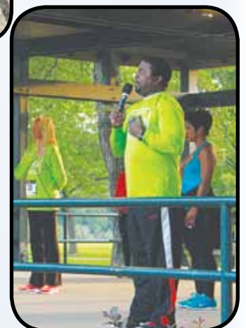
Prince Reed sings the National Anthem (above).