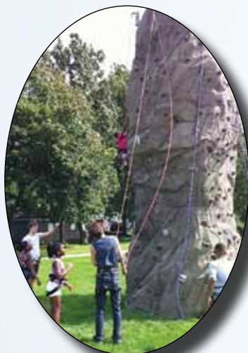
The Climbing Wall was a real challenge.