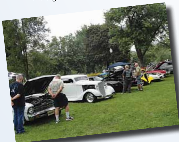
The annual car show drew an admiring audience.