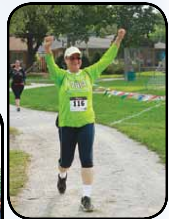
The finish line! (above & below).