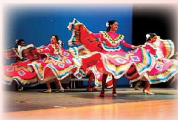
The Mexican Folkloric Dance Company of Chicago will perform at South Suburban College to celebrate Mexican/Spanish culture through song and dance.