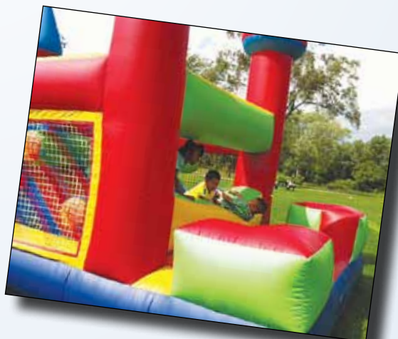
Fun Inflatables were popular.