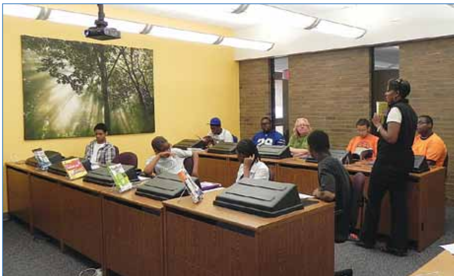
Computer classes for residents of all ages has proven to be very popular.