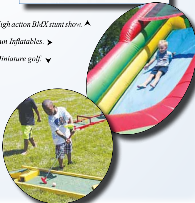
Miniature golf. ▼