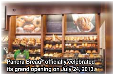
Panera Bread® officially celebrated its grand opening on July 24, 2013.