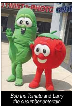
Bob the Tomato and Larry the cucumber entertain

with Bob and Larry in the store. Other children's activities included a fantastic Instagram contest in which a child could win a birthday party complete with a live appearance from Bob and Larry.