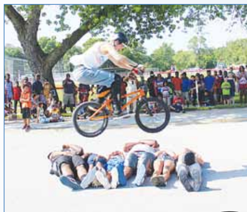
High action BMX stunt show. ▲

The Village of South Holland greatly values the support of our 2014 Independence Day Celebration sponsors. Thank you for your partnership and investment in our community.