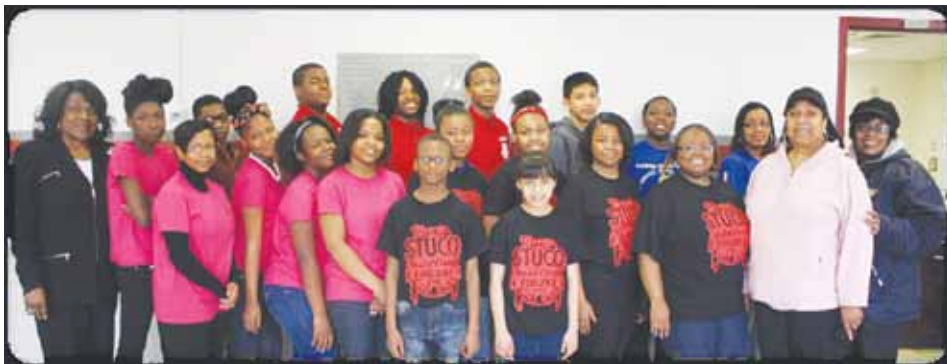
Coolidge Middle School students took part in an Arbor Day project with representatives of Top Ladies of Distinction.

Visit "Continuing Education" online at www.ssc.edu for a complete listing of classes, or call 596-2000, ext. 2231.