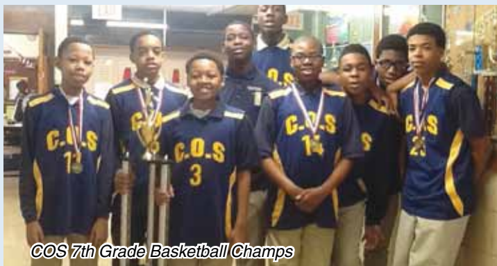
COS 7th Grade Basketball Champs