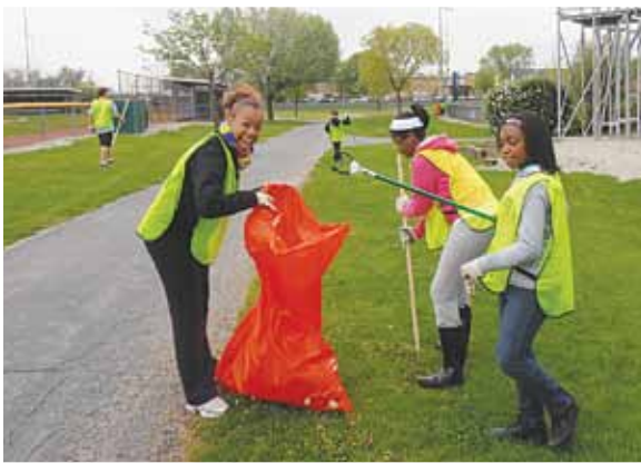
Residents assist with trash pick up at Gouwens Park during 2013's Take a Bite Out of Grime event.

The 19th annual Take a Bite Out of Grime will start at 8:30 a.m., Saturday, May 10 , at the South Holland Community Center, 501 E. 170th St.