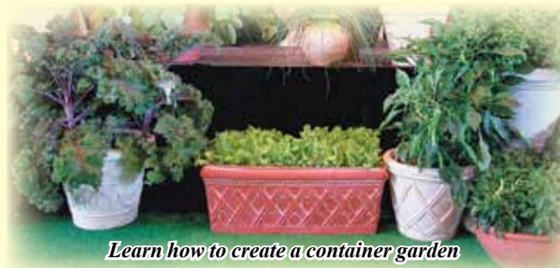
Learn how to create a container garden

Learn how to beautifully arrange flowers. An arrangement will be raffled at the end of the program. Tuesday, May 20, 7pm. North Meeting Room.