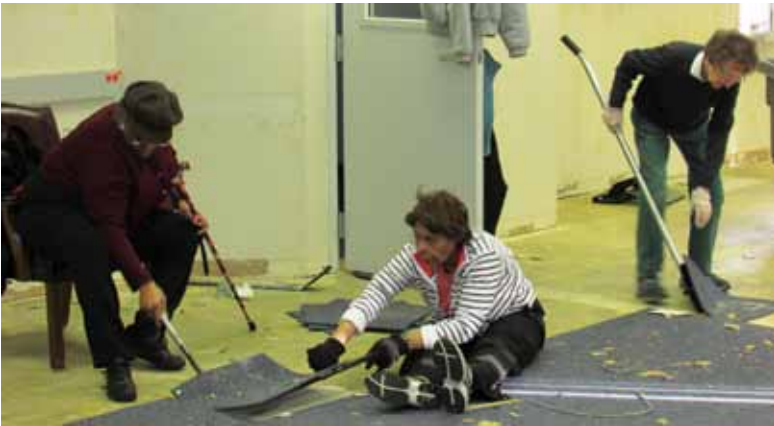
Citizens Police Academy alumni assist in the demolition at the new police station.

The village extends a big “Thank You” to the South Holland Lions Club , Citizen Police Academy alumni and the participants in the Cook County Sheriff’s Work Alternative Program who helped with demolition work at the new police station.