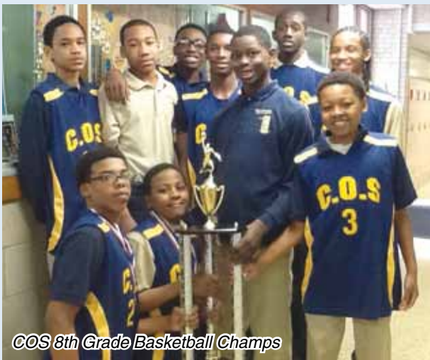
COS 8th Grade Basketball Champs