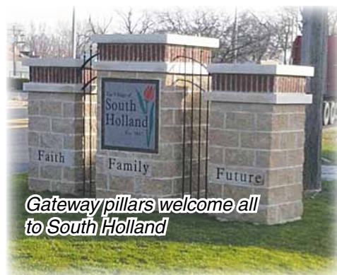
Gateway pillars welcome all to South Holland

We installed new village street name signs with updated logo along South Park Avenue, 170th Street, and Cottage Grove Avenue.