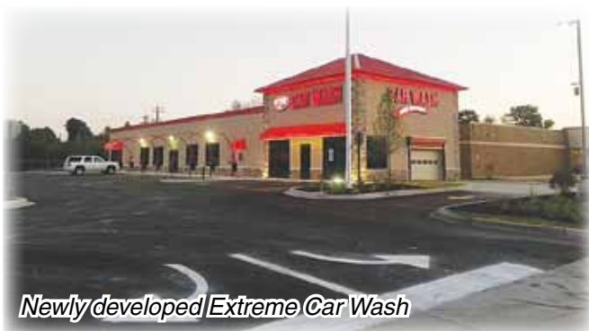
Newly developed Extreme Car Wash

Also, as one very successful TIF (Tax Increment Finance) expires, a new TIF district will be pursued to provide for