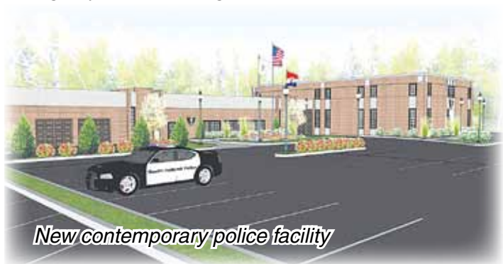
New contemporary police facility

ESDA (Emergency Services Disaster Agency) recruited nine new volunteer members to support public safety efforts at community events, to provide traffic safety assistance at emergency scenes, among other duties.