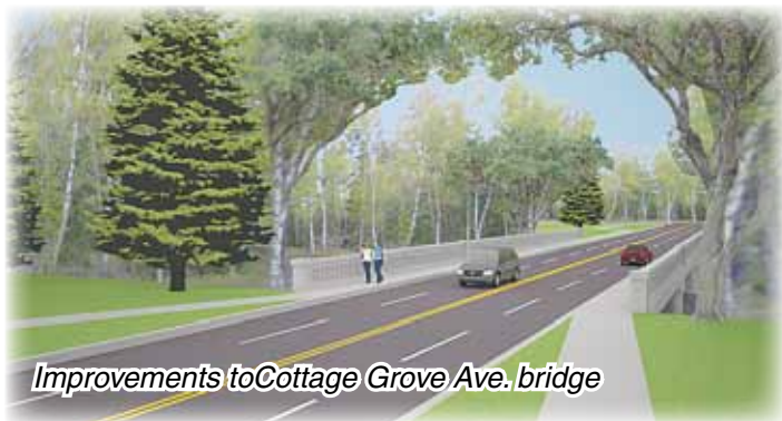
Improvements to Cottage Grove Ave. bridge

What a winter 2013/2014 has been! Our shared experiences of heavy snowfalls and arctic cold temperatures will not be easily forgotten. This is truly a winter that reminds us that God is in control and we're not. It makes us more appreciative of a warm home, loving family and friends, and a great community to live in and share some of life's experiences. We can also appreciate our tireless South Holland Public Works employees, who have done an outstanding job keeping our roads open and maintaining the integrity of our infrastructure. We are grateful for our Police and Fire personnel who work around