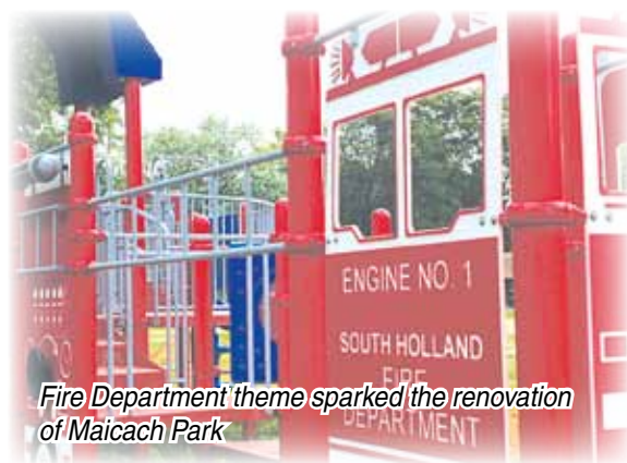
Fire Department theme sparked the renovation of Maicach Park