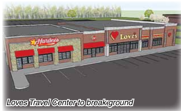
Loves Travel Center to break ground

In 2014, we will move forward with the renovation and upgrading of our village parks, as part of a multi-year site improvement initiative. Additionally, Loves Travel Center, a national corporation, is expected to break ground this spring