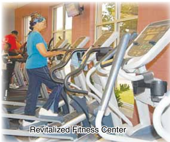
Revitalized Fitness Center

We were grateful to be awarded a state grant for three community service improvement projects – mitigation of flooding around fire station two at 1450 East 170th Street; acquisition and installation of a new generator at the Sibley water pumping station; and upgrade to cellular communications of our water pumping and lift stations to ensure uninterrupted service.