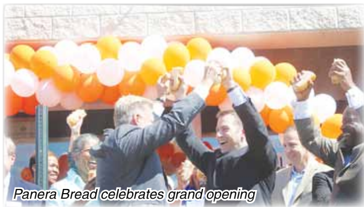
Panera Bread celebrates grand opening

We will resurface many additional miles of our local roads and install additional street name signs throughout the community. The village will begin reconstruction of the Woodlawn East bridge, as well as more improvements to the Cottage Grove Avenue bridge and also plan for the major resurfacing of Cottage Grove Avenue, Vincennes Avenue and 154th Street, all north of Route 6.