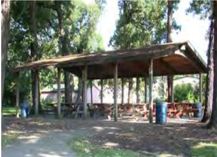
Pavilion at Paarlberg Park located at 172nd Place and Paxton.