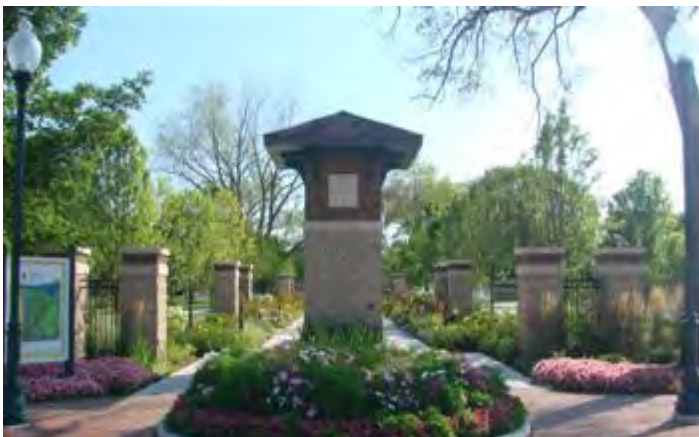
The Promenade at Veterans Park.