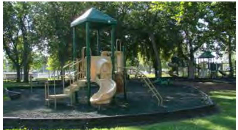
The Small Playground at Vets is recommended for children ages 2-5.