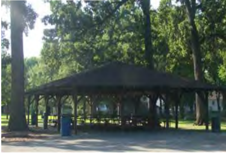
Pavilion at Van'O Park located at 157th and Orchid.