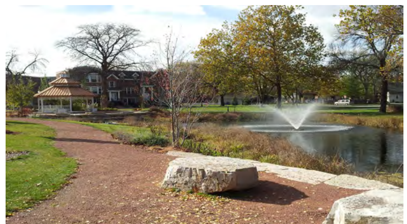
Veterans Park Pond and Gazebo