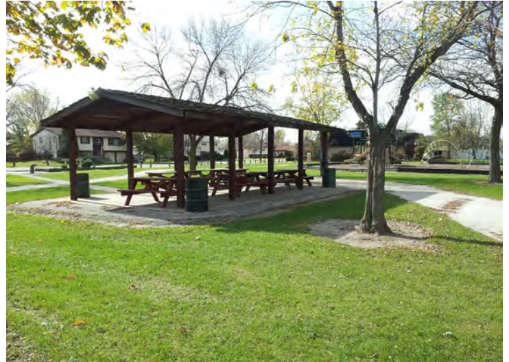
Pavilion at Hollandale Park located at 164th and Michigan.