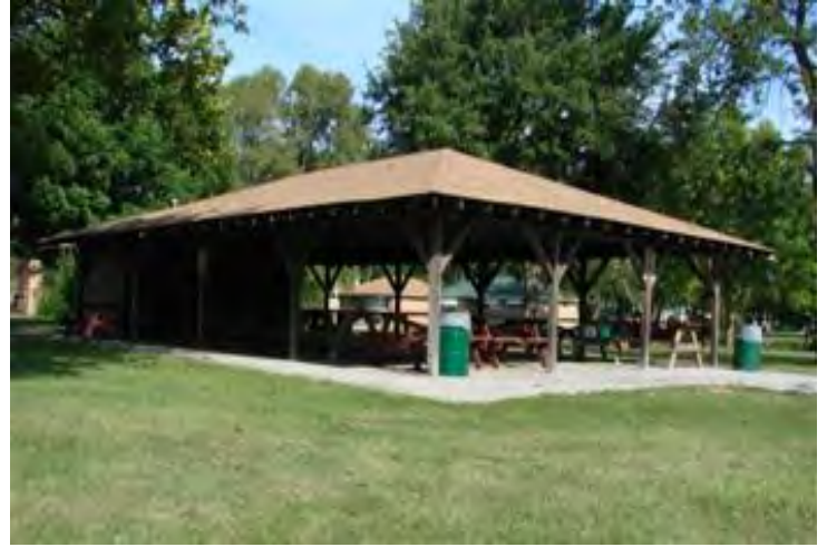
Pavilion at Maicach Park located at 165th and Ellis.