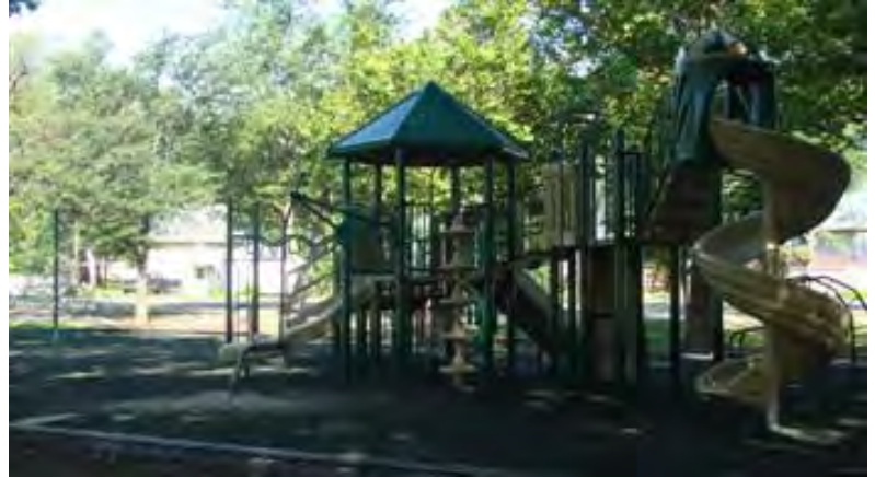
The Large Playground at Vets is recommended for children ages 5-12.