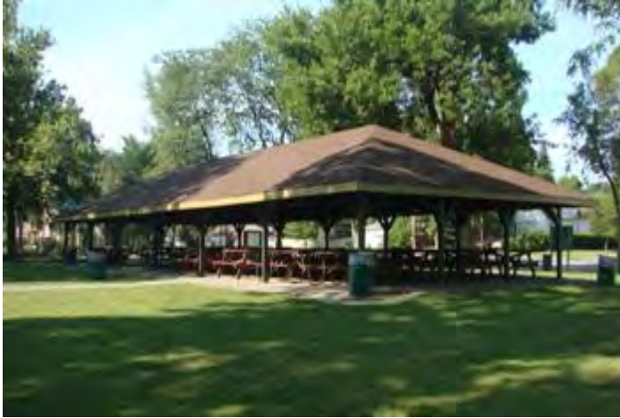
The Pavilion at Veterans Park will accommodate up to 200 people.