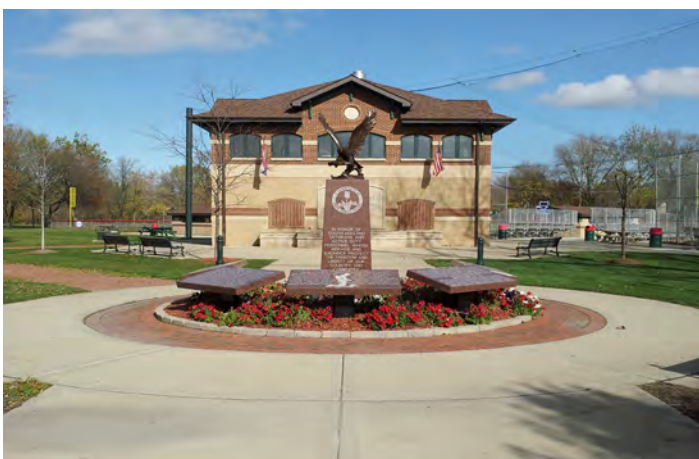
War Monument at Veterans Park